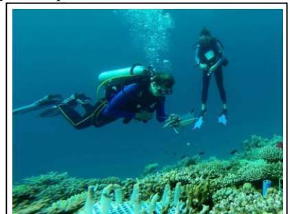
Conducting PAM fluorometry measurements on a coral reef