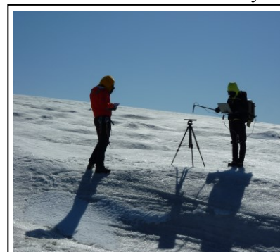
Field work in Iceland